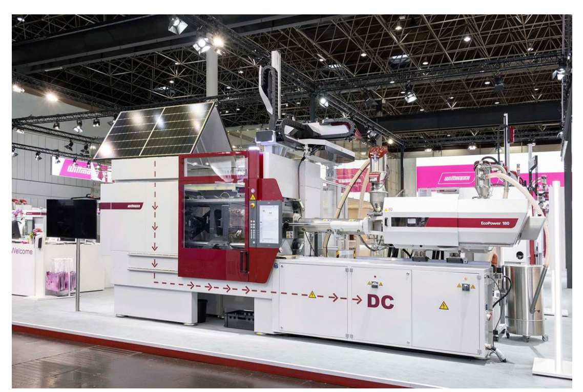
Fig. 2: EcoPower 180 DC – Concept study of an all-electric injection molding machine that can be operated with direct current