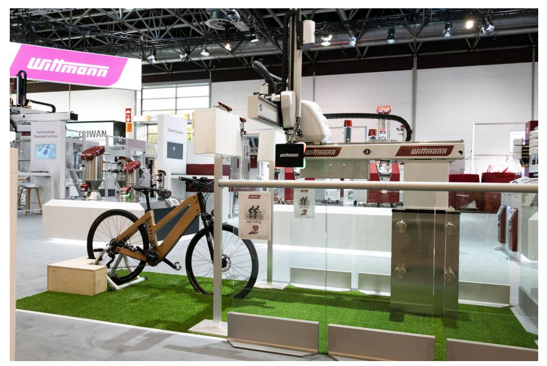
Fig. 4: ErgoRobot – Primus 14, driven by muscle power