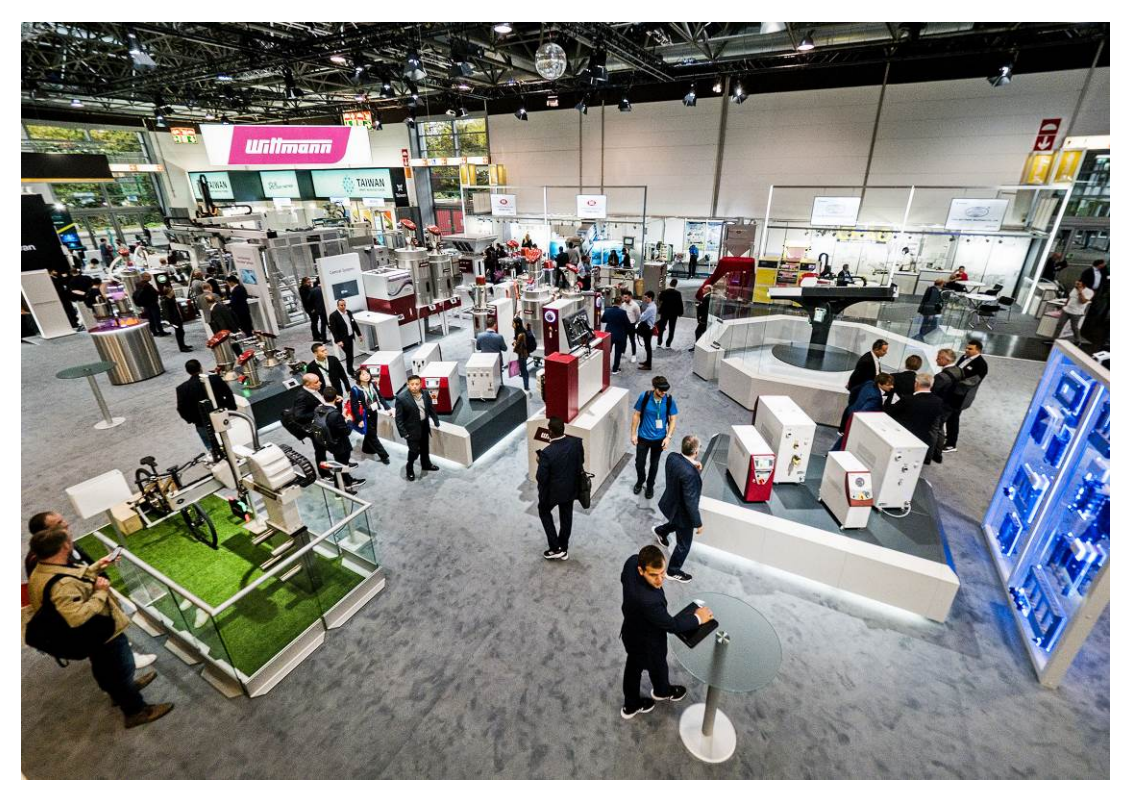
Fig. 3: Booth WITTMANN Technology